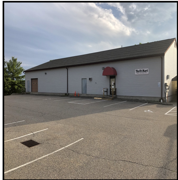
Front of Rear Building