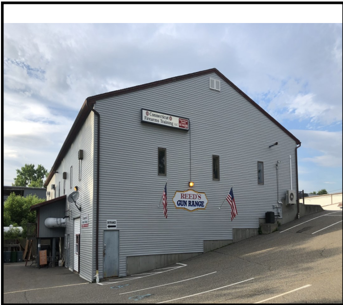
Rear Side of Rear Building