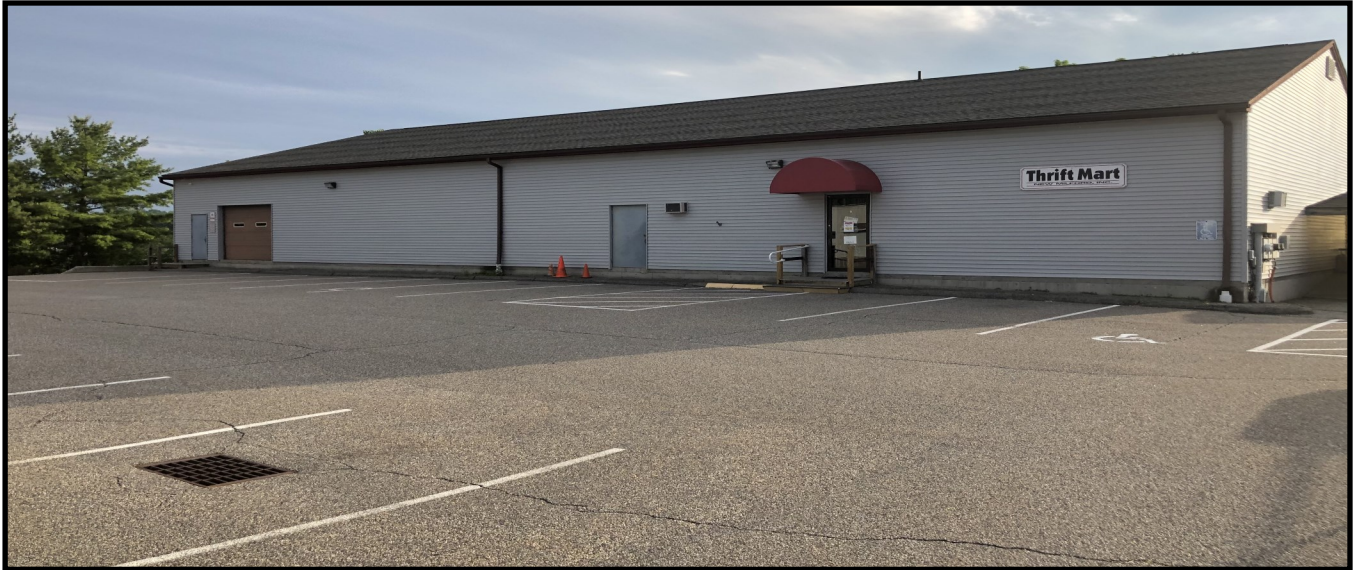
Front Back of Front Building